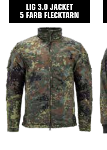
5 FARB FLECKTARN